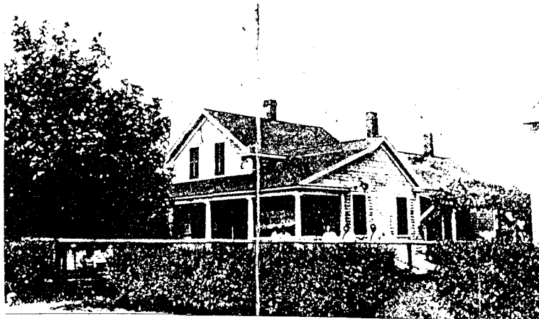
Van Wyen House, c. 1920.