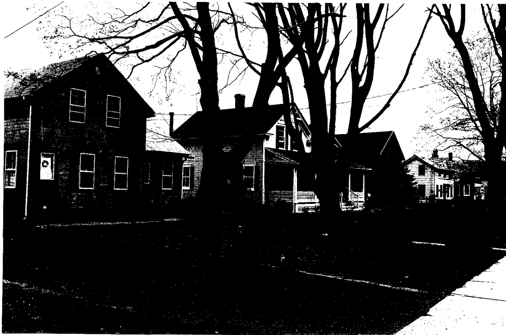
Neg. KK XXIII-26, fm. NW, view of streetscape with Van Wyen House at center.