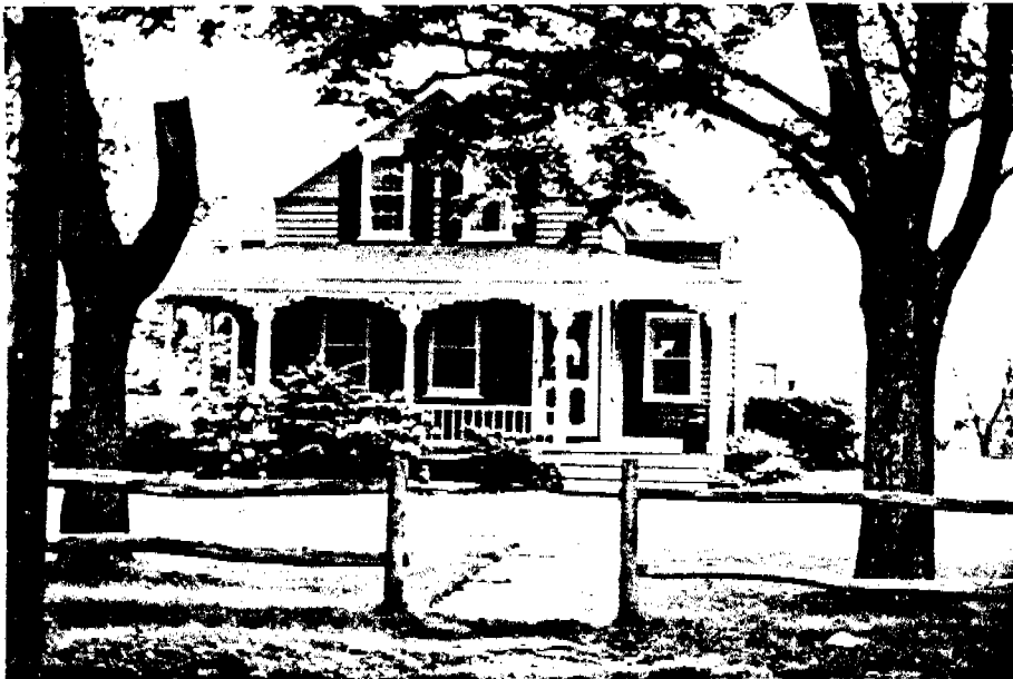
HP-1 front (west) facade