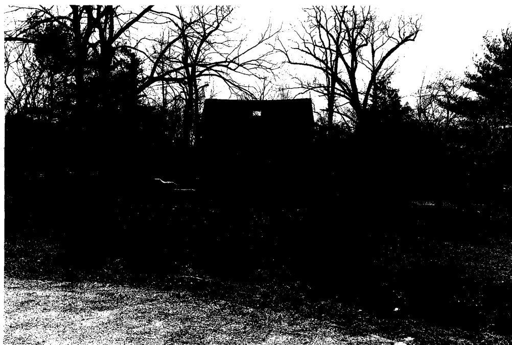
Neg. KK XVI-20, fm. N, showing cottage at the south end of the property.