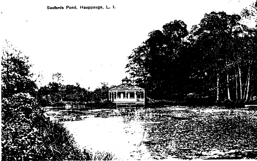
Sanford's Pond, Hauppauge, L. I.

Sanford's Pond, later known as Scholl's Pond, is no more. Today it is the easternmost exit from the state building to Veterans Highway. If you take this exit and look to your right, you may still see the foundation of the Boathouse.