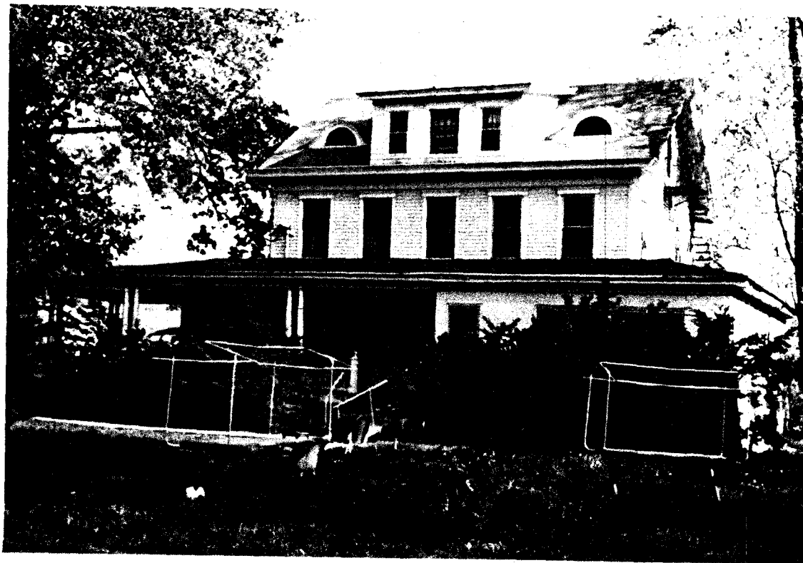
This house at 220 Veterans Highway was known as the Sanford Place, later the Scholl house, and more recently Marion's Nursing Home. This photo was taken in 1979.