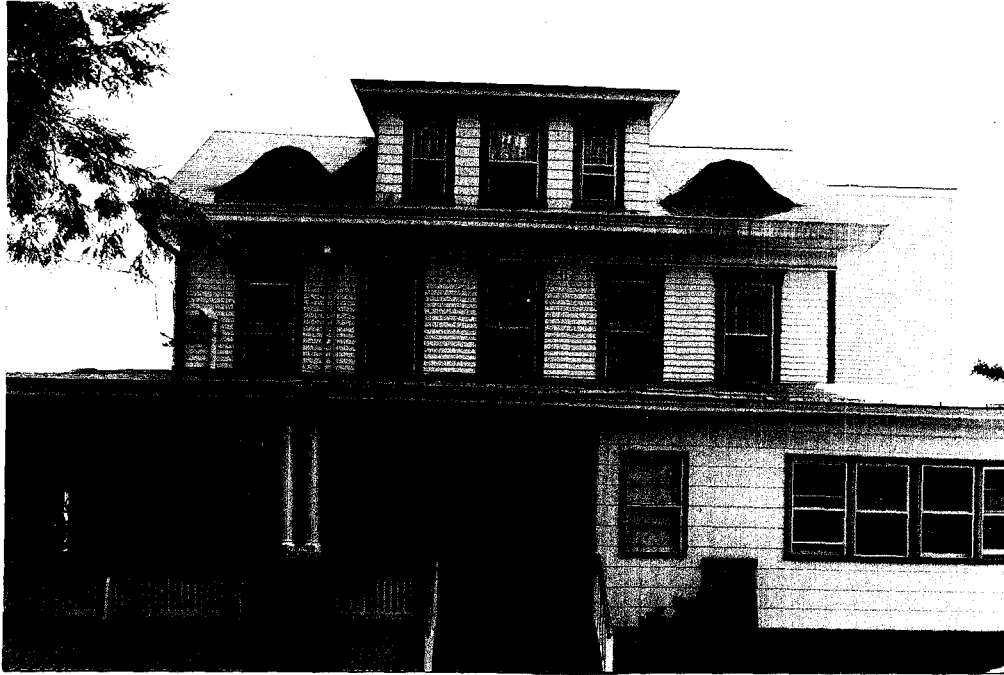
Neg. KK XVI-10, fm. N, showing principle facade and entrance.