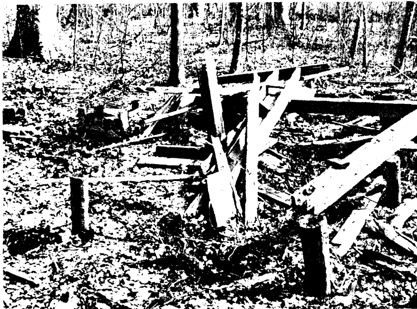
The foundation of the Boathouse. This photo was taken in 1979.

Sanford's Pond, later known as Scholl's Pond, is no more. Today it is the easternmost exit from the state building to Veterans Highway. If you take this exit and look to your right, you may still see the foundation of the Boathouse.