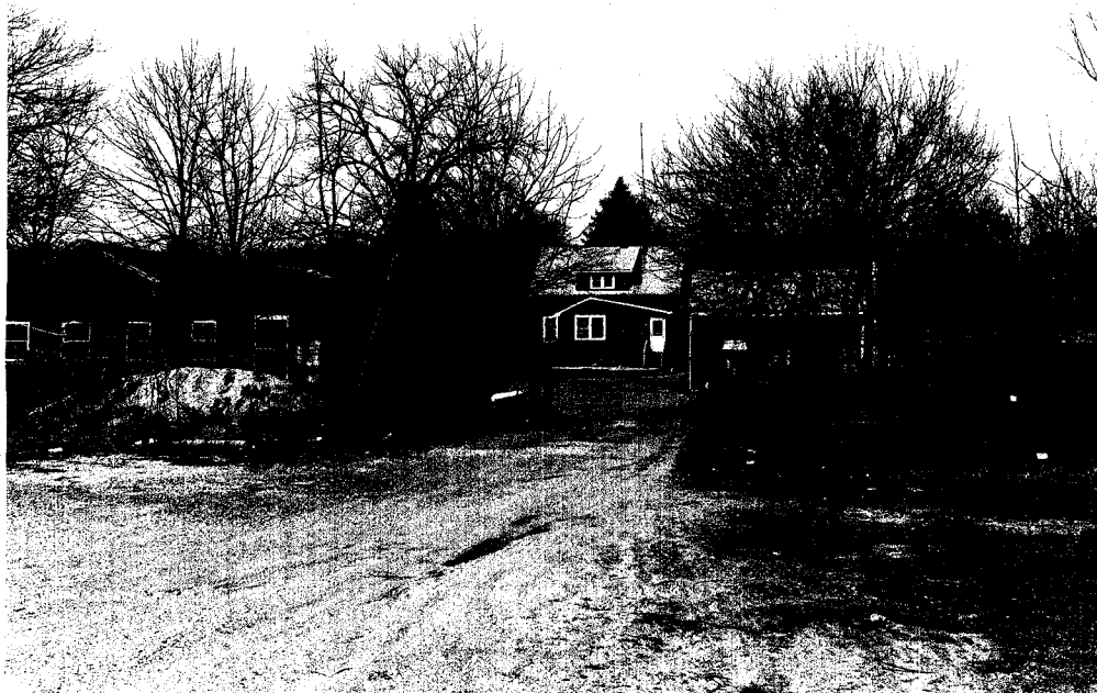
Neg. KK XVI-15, fm. S, showing portion of back lot and chicken coops.