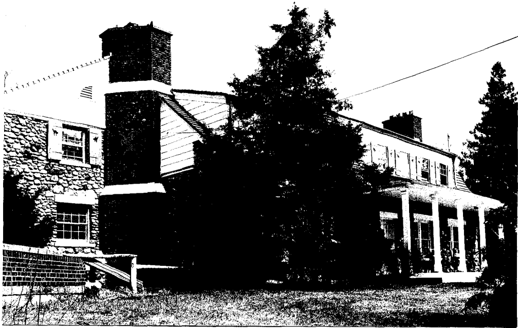
Neg. KK XVI-3, fm. SW, view of brick chimney connecting the wing with the main block.