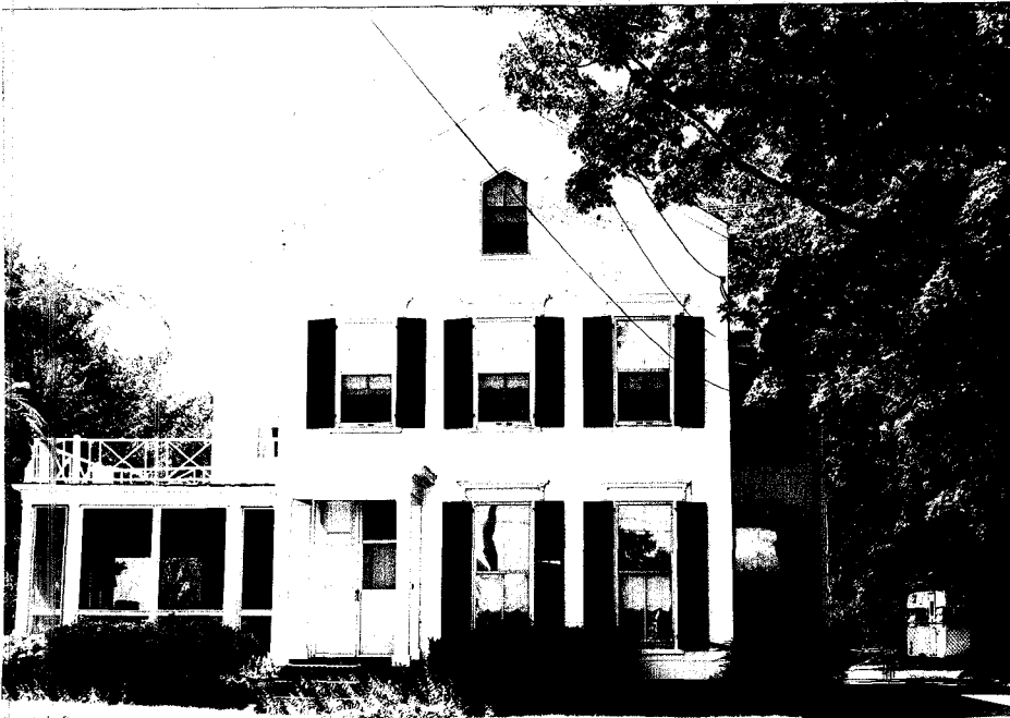
HP-1 Bay Shore Roll #Q6; Neg. #14 Front Facade