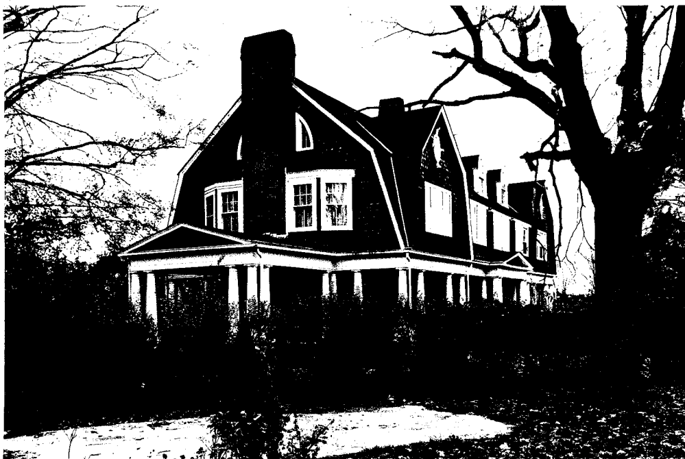
Neg. KK I-20, fm. W. The west chimney rises from the 2nd floor level over the subsumed porch. This is a characteristic chimney treatment of the architect I.H. Green. It is possible that perhaps he designed this house.