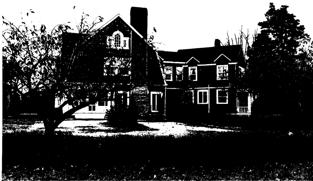
Neg. KK I-21, fm. SE. East chimney and angled wing.