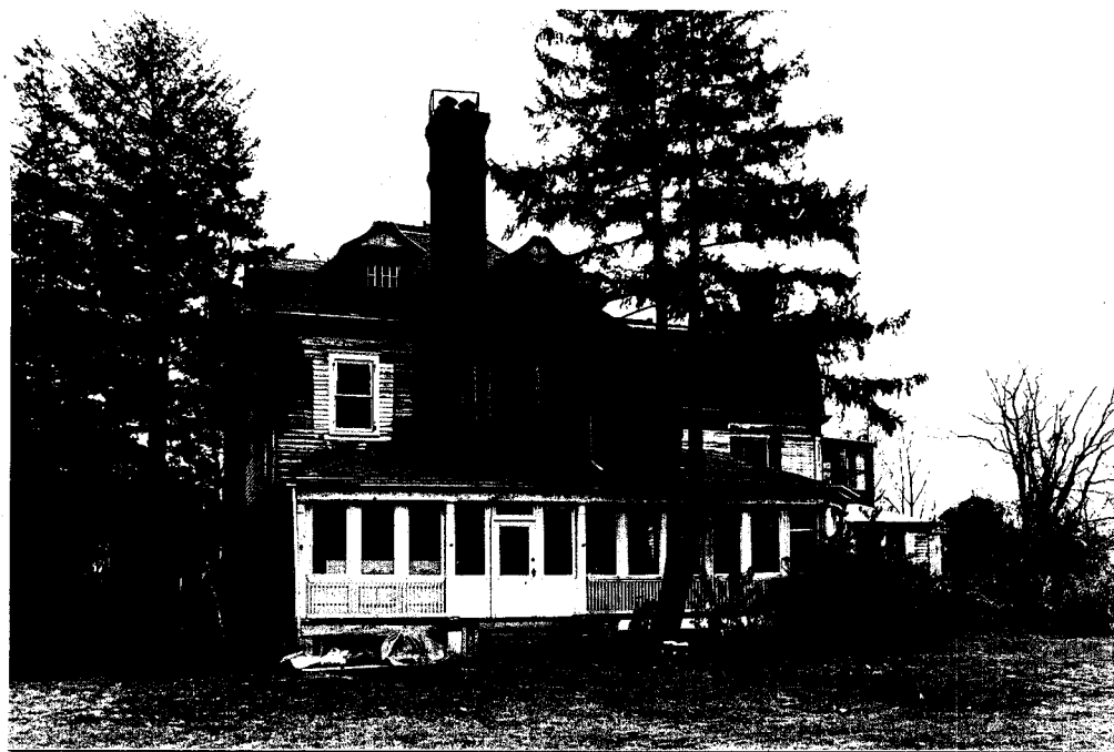
Neg. KK I-17, fm. W. West facade undergoing restoration.

Edward Spring Knapp House 52 Saxon Avenue, Bay Shore