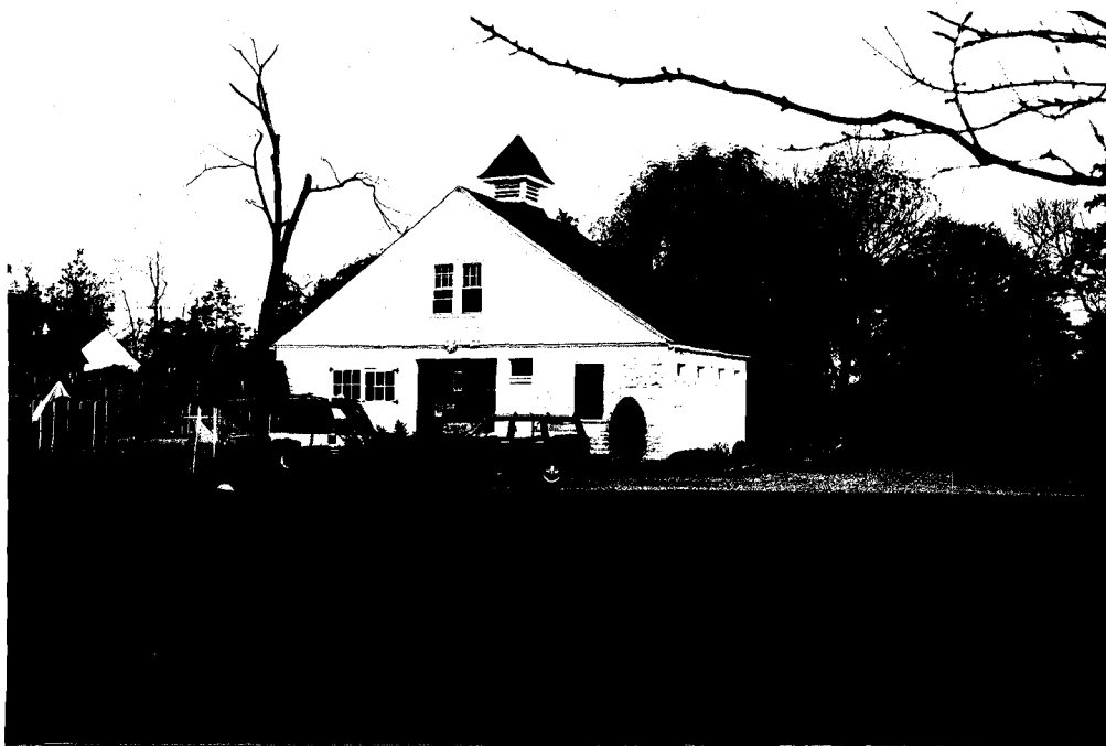
Neg. KK II-24A, fm. S/SE. view of barn/carriage house.