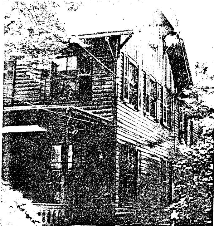
HP-1 Bay Shore Roll #Q6; Neg. #1 Front facade & north side.

Rear Additions circa 1925. Addition of fireplace.