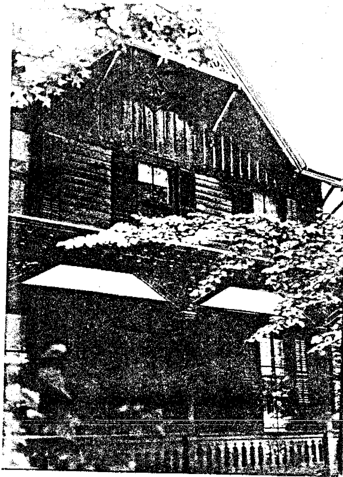
· Stellenwerf House, Ocean Avenue Bay Shore Roll #06 Negative #0 front September, 1975