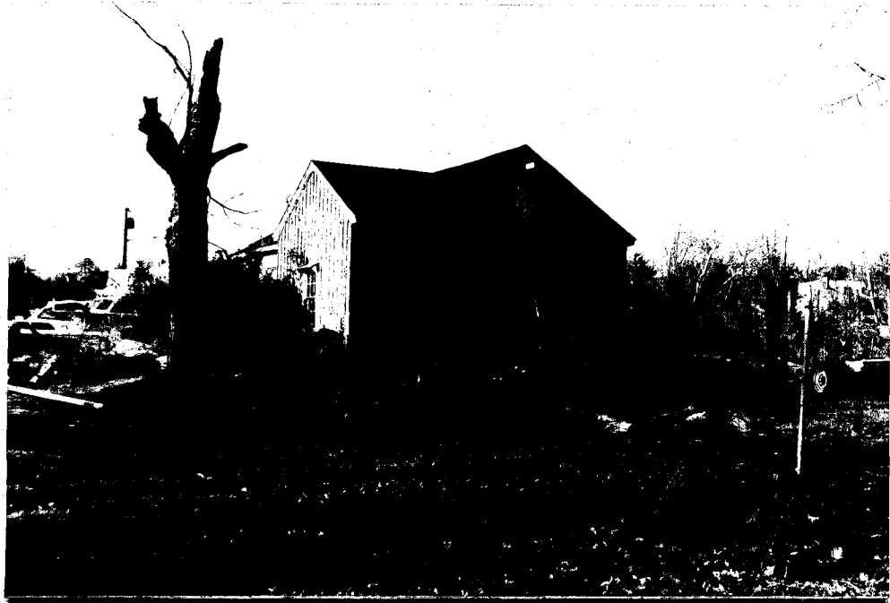
Neg. KK III-28, fm. SE. View of outbuilding/barn near creek's edge, west of house.