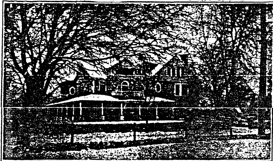
Bay Shore Journal , "Some of Bay Shore's Beautiful Homes", 1914.