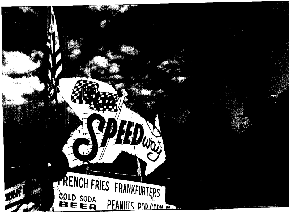
Neg. KK XXVIII-6 showing Islip Speedway sign on display at the museum.