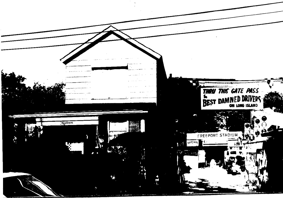
Neg. KK XXVIII fm. W. Principle facade. -3