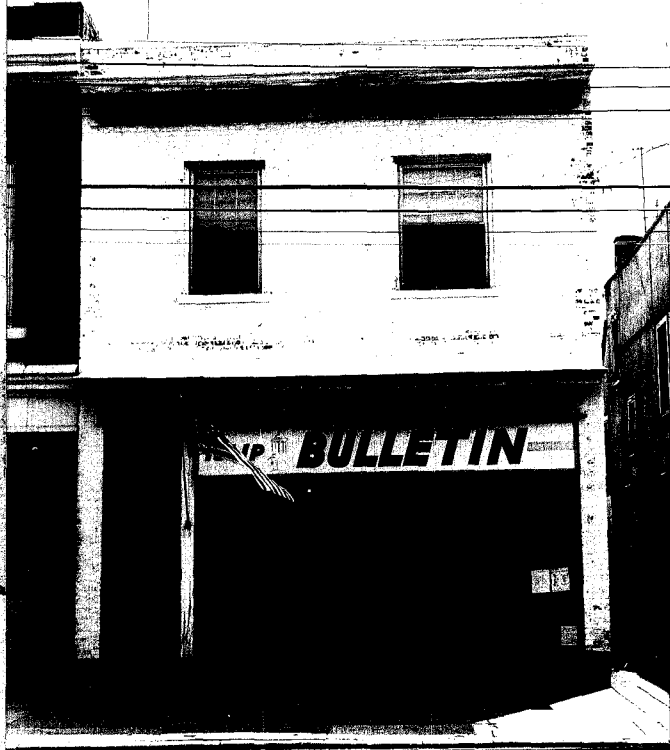
HP-1 Bay Shore ROLL #Q4; Neg. #8. Front (North) facade.