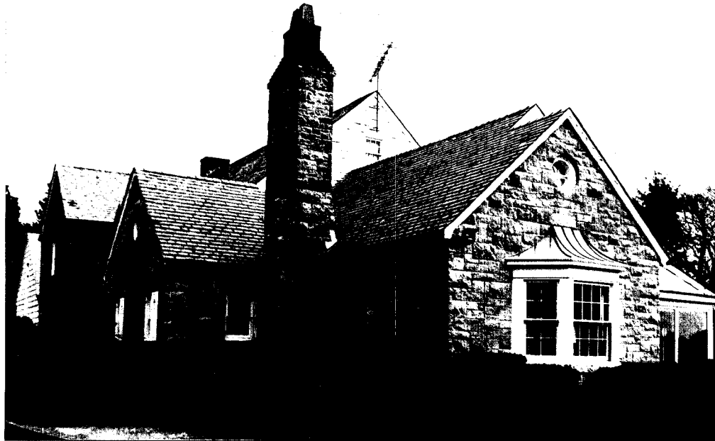
Neg. KK XIV-18A, fm. W, showing west and north (entrance) facades.