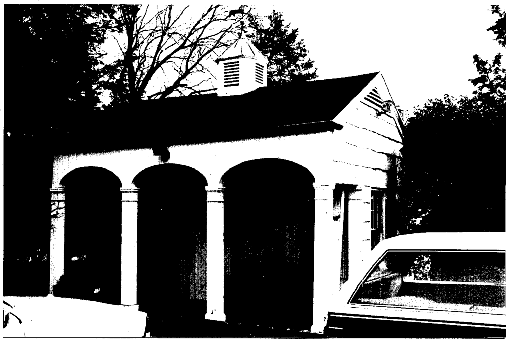
Neg. KK XIV-19A, fm. N/NW. View of stable.