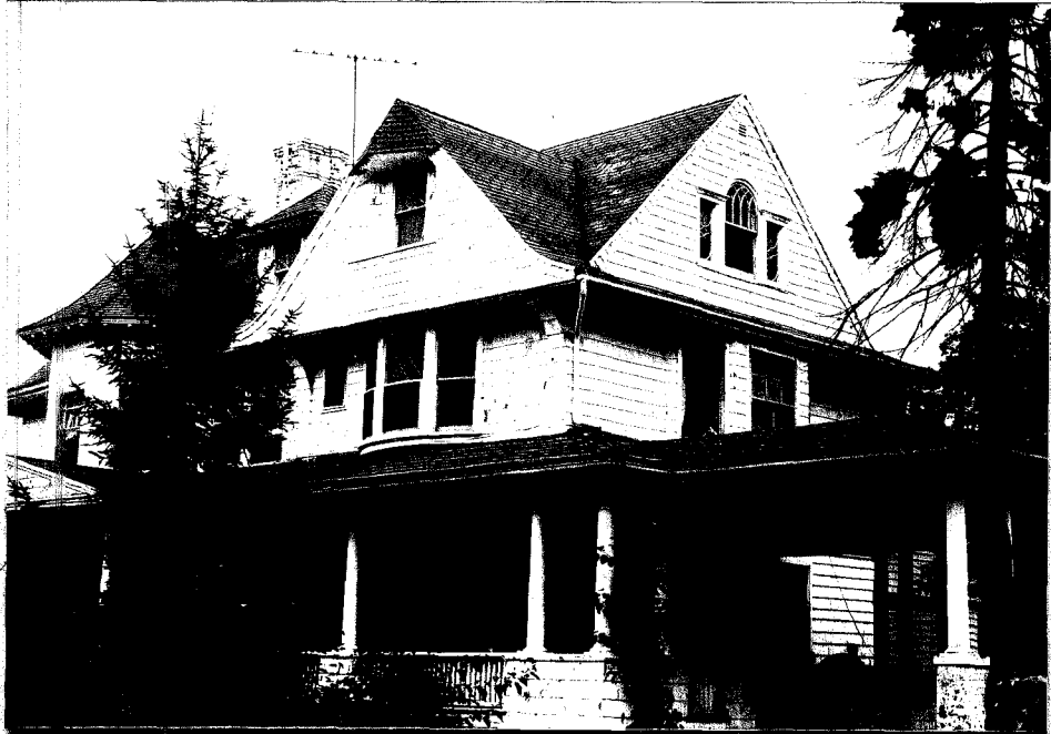
HP-1 Bay Shore Roll #Q4; Neg. #1 East (front) & North Sides.