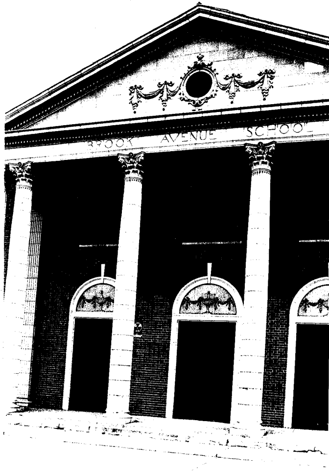
Neg. KK VI-19; fm. W/SW. Detail showing Adamesque entrance.