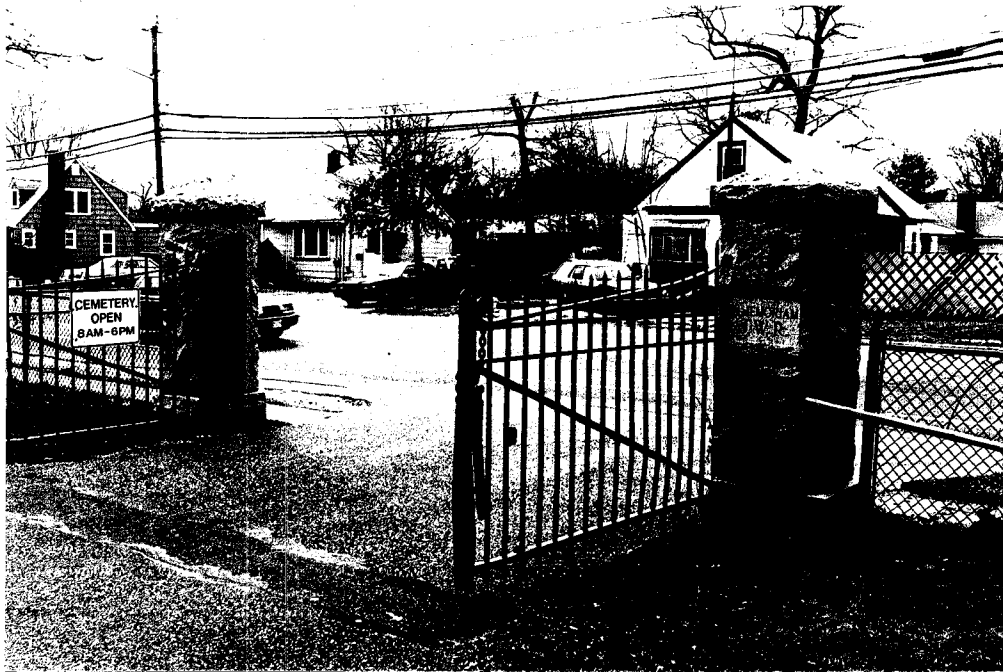
Neg. KK VI-8, fm. NE. Gate posts on Brentwood Road.