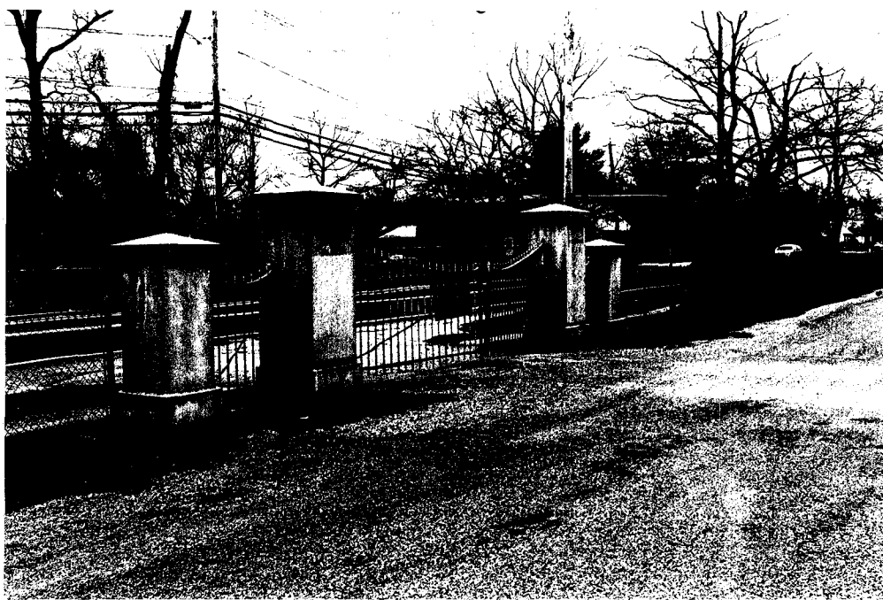
Neg. KK VI-6, fm. SE. Entrance gates on Brentwood Road.