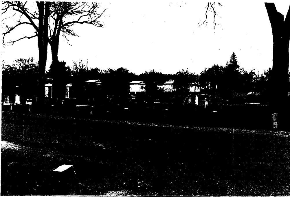
Neg. KK VI-4, fm. SW. General view of Oakwood Cemetery.