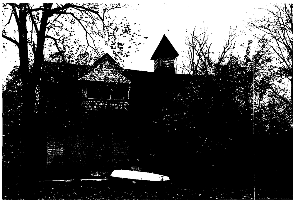
Neg. KK II-16A. Barn/carriage house, view from east.

This structure pre-dates the house and was built before 1902.