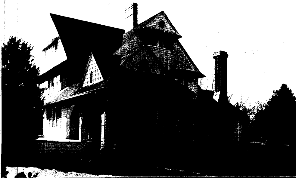
Neg. KK III-5. J. Mollenhauer House, detail of porte cochere from NE.