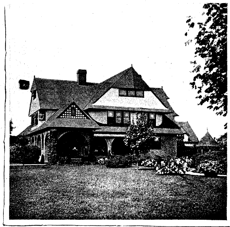
Byrnes, Horace. Pictorial Bay Shore , 1902, p. 57. 1902 view of house front,