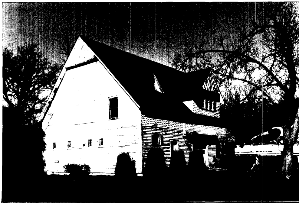
Neg. KK III-8, fm. SE. Barn/carriage house N/NW of main house.

The barn/carriage house is a 2½ story, gable roof, Queen Anne building with filled gable peaks decorated with splayed boards. The ground story is clapboard and the upper story contains a variety of shingle patterns. A flared hood covers the entrance bay and Queen Anne windows with border panes remain.