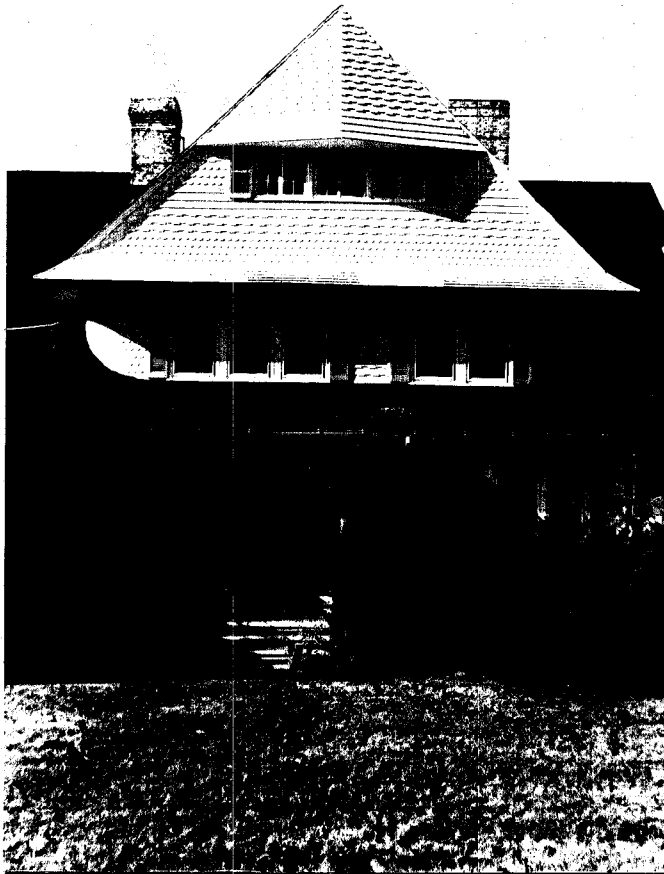
Neg. KK III-7 J. Mollenhauer House, detail of front gable from east.