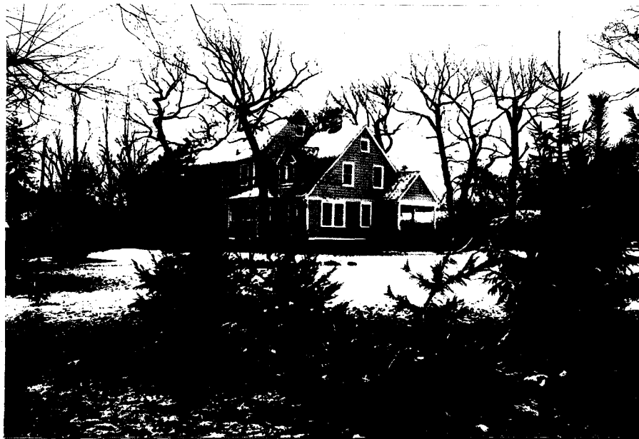
Neg. KK XX-22, fm. NW, view of west and north facades.