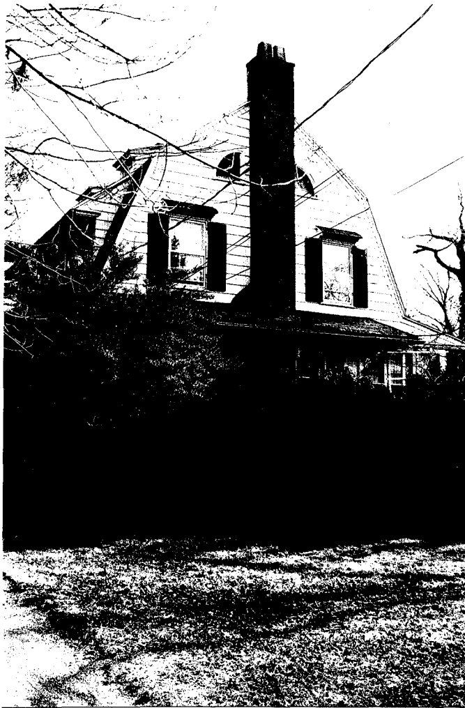
Neg. KK XI-16, fm. E/SE. View of house from Eaton Lane, showing chimney, window hoods, shingled rake, and attic quarter round windows.