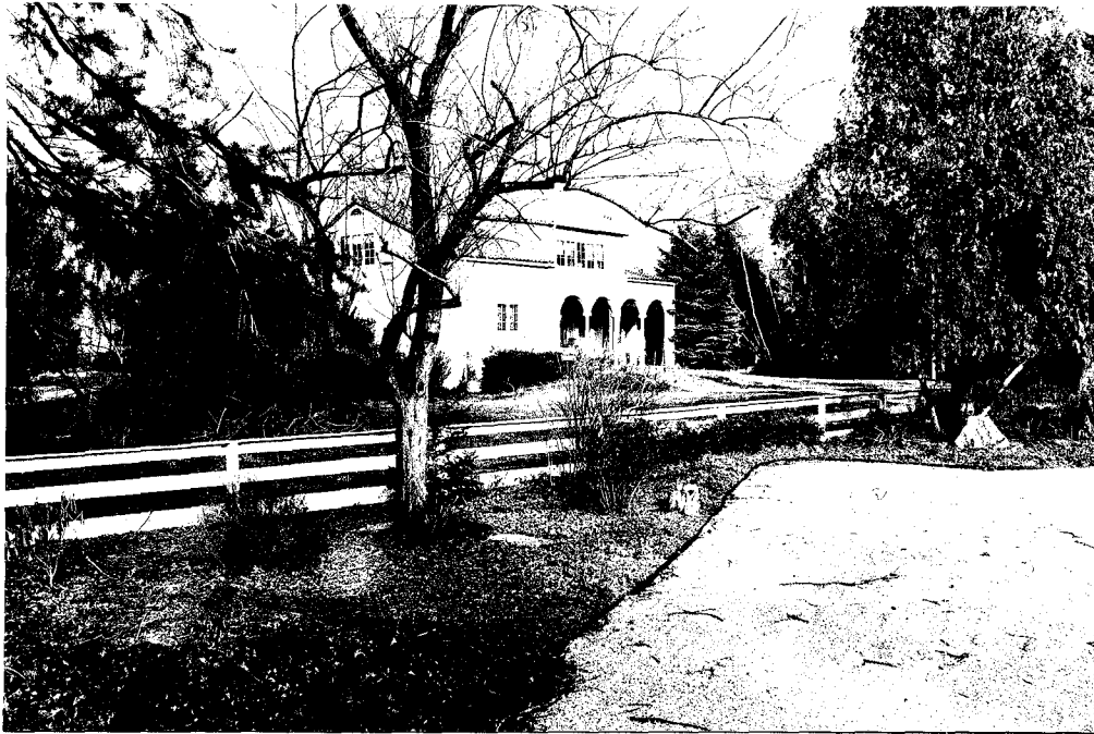
Neg. KK IX-9, fm. W/SW. View of south facade colonnade from Sequams Ln./ Eaton Ln. Extension.