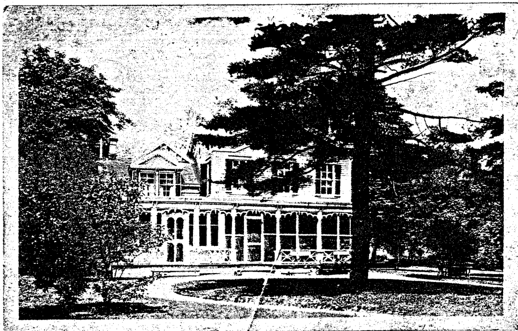
Old postal card view of Brown - Mackenzie house on Middle Road