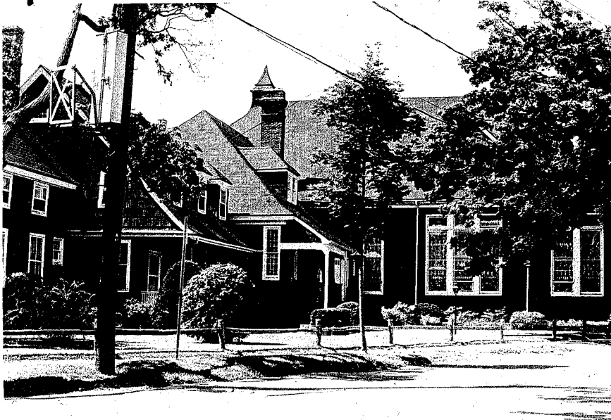
NJM-5, neg 8 view from south