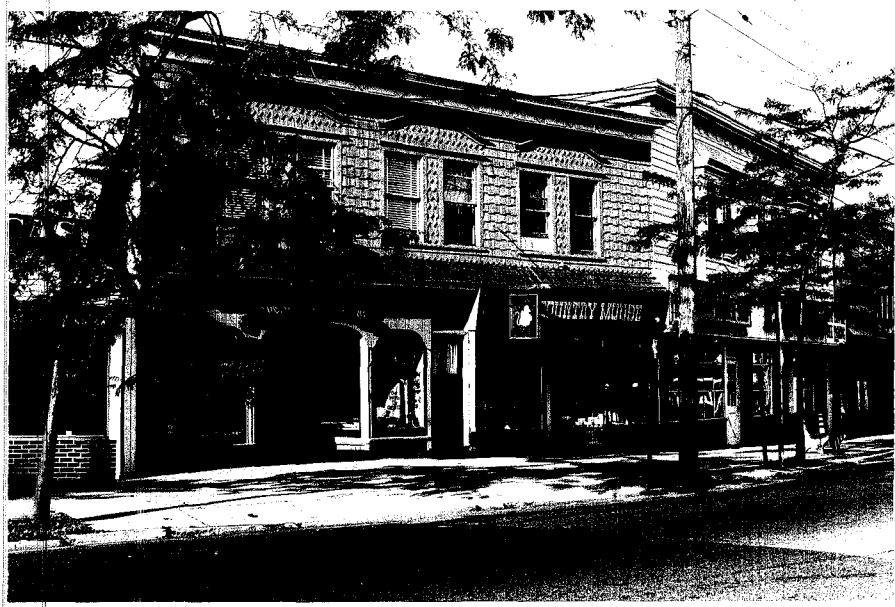
front (north) facade