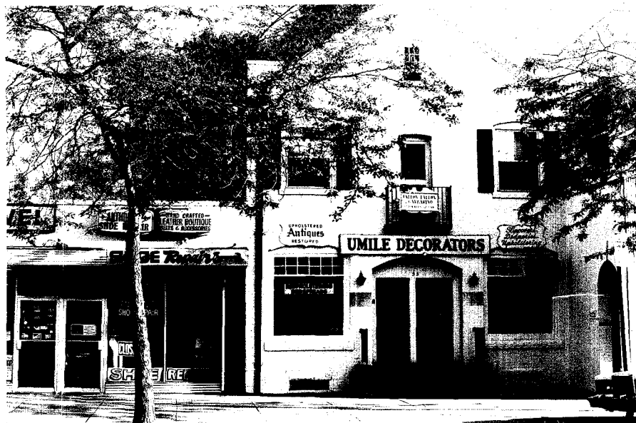
front (south) facade