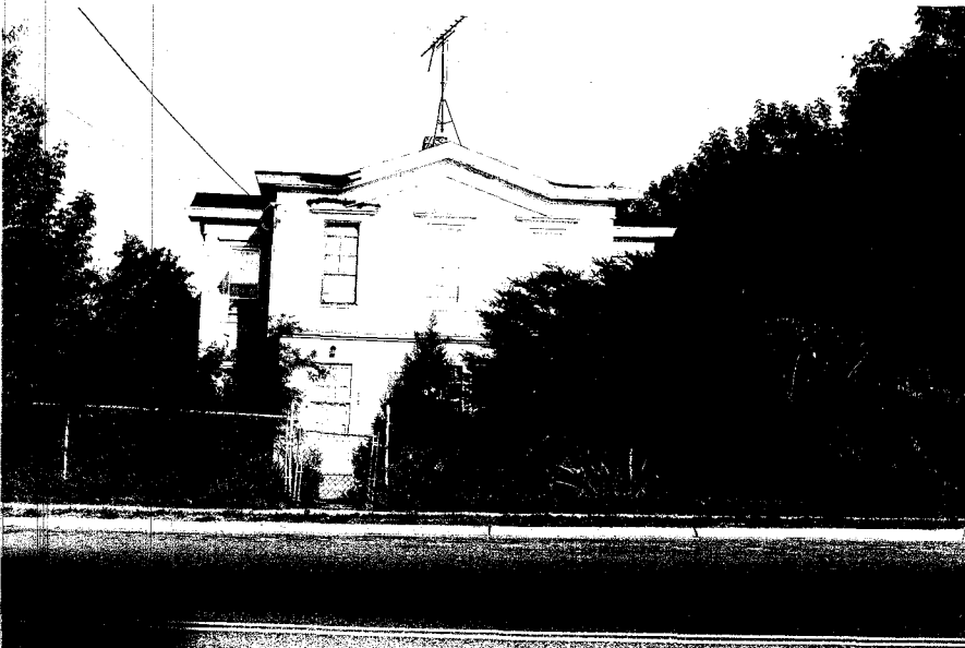
front (east) facade