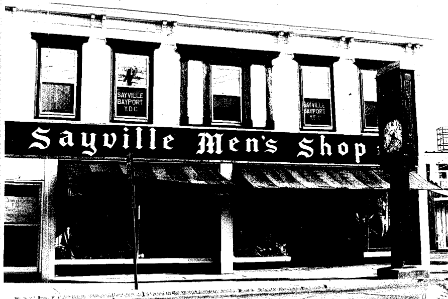
HP-1 front (south) facade