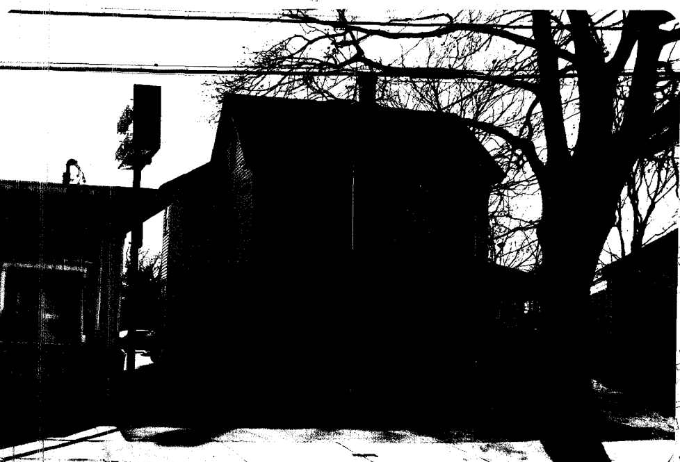
front (north) facade