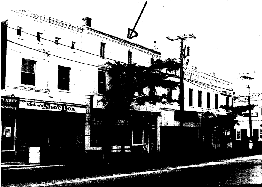
HP-1 from northeast