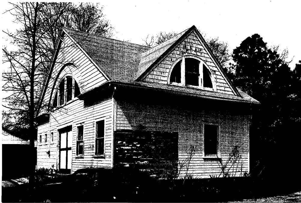
Neg. KK XXIII-16, fm. SW. View of carriage house with large semi-circular windows in the gable peaks and recessed pediment on principle (west) facade.