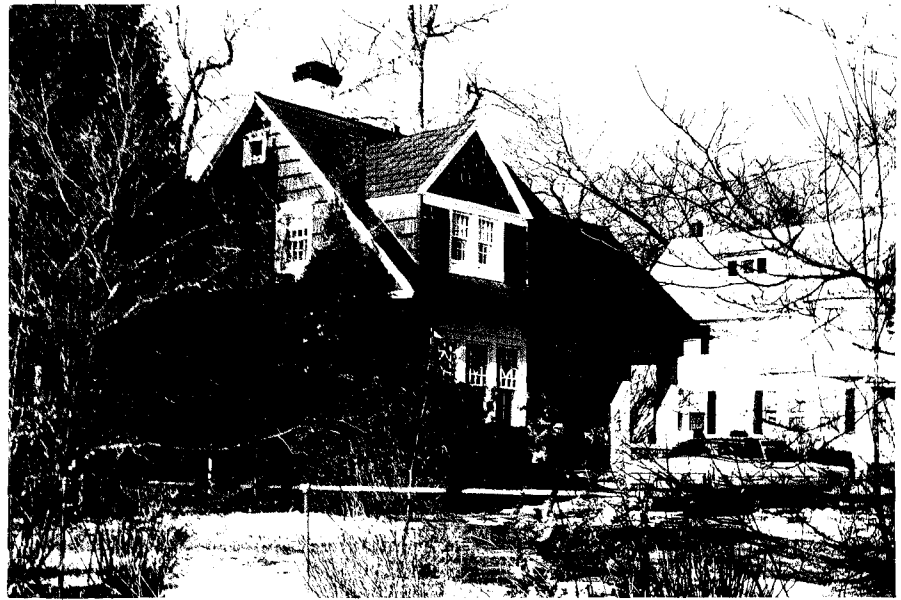
HP-1 Front, from SE