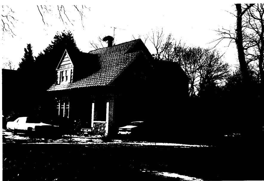
BVL 1-5 View from NE - note stonework and photo of porch ariginal with house.