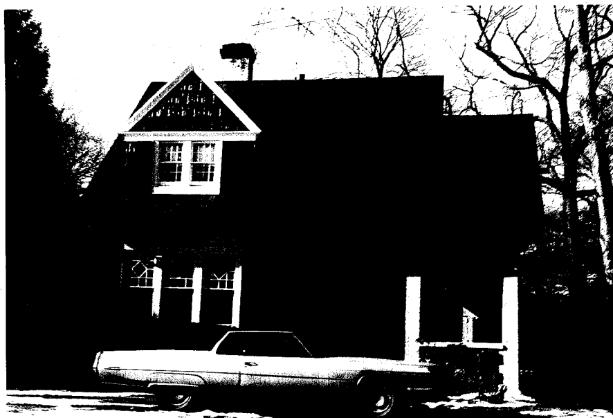
BVL 1-3A Front view, from the east