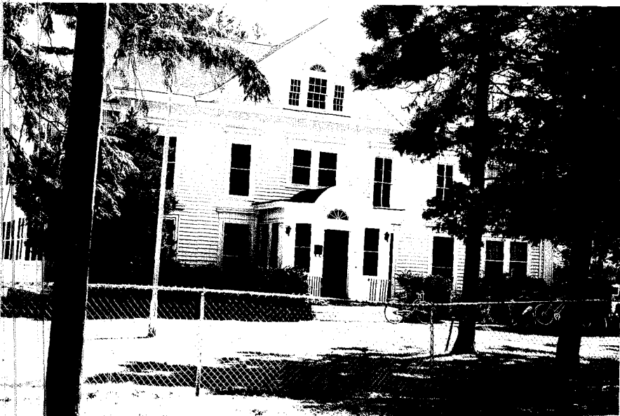
HP-1 west facade