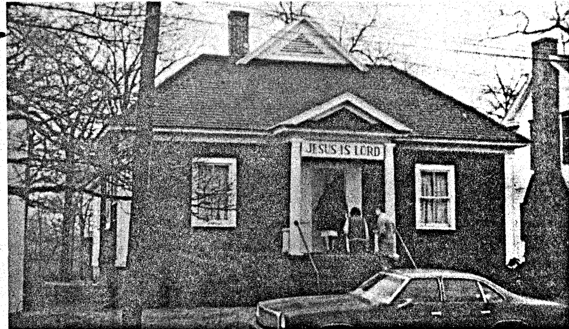
PENTECOSTALISM , celebrated by handclapping, foot stomping, singing and loud shouts of "Hallelulah" and Amen", has come to Sayville. The new church is at the former Odd Fellows Hall on Foster Avenue.