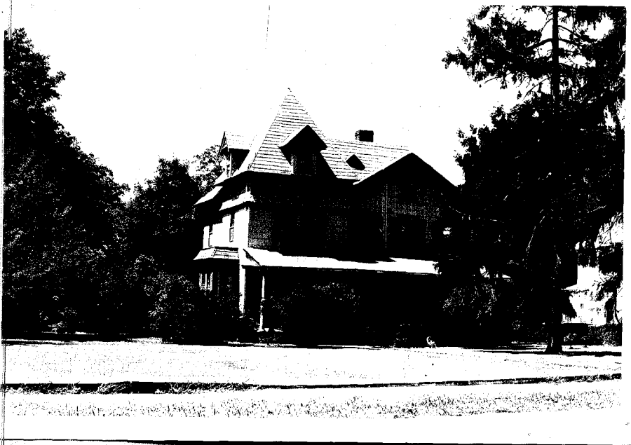
HP-1 east (front) facade