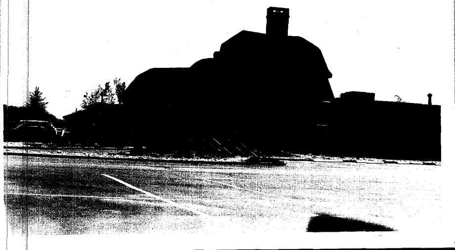
HP.1 view from northwest