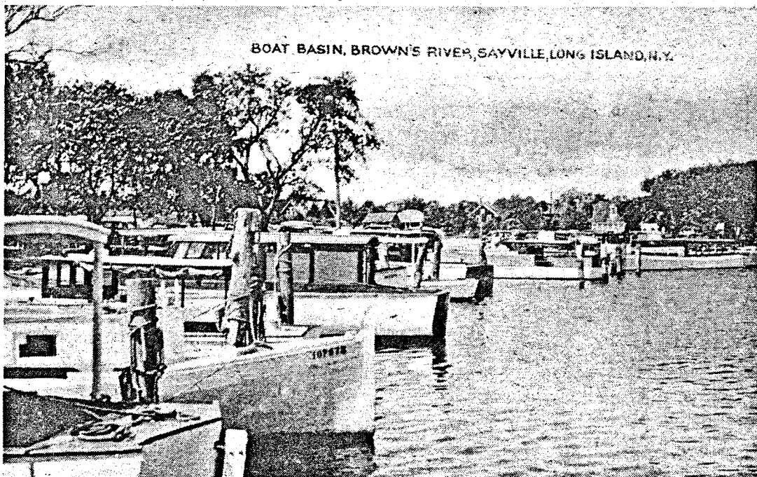
BOAT BASIN, BROWN'S RIVER, SAYVILLE, LONG ISLAND, N.Y.