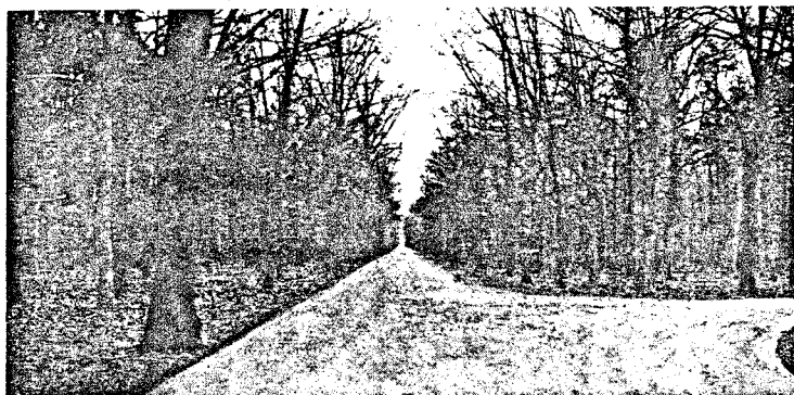
Vanderbilt Avenue, a typical wooded street