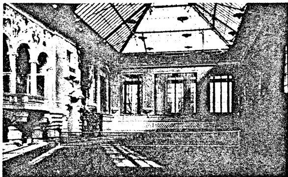
The enclosed Tennis Court