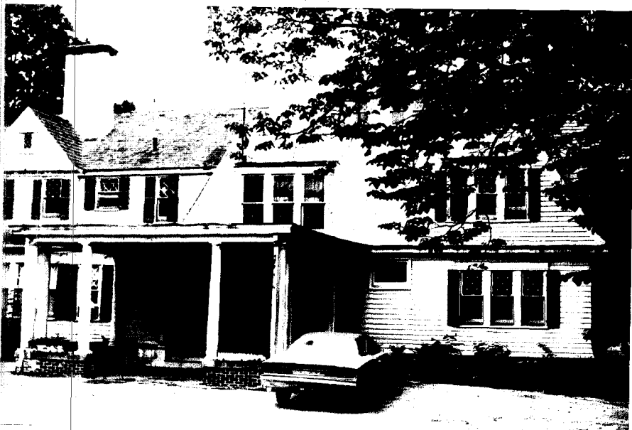
HP-1 front (north) facade