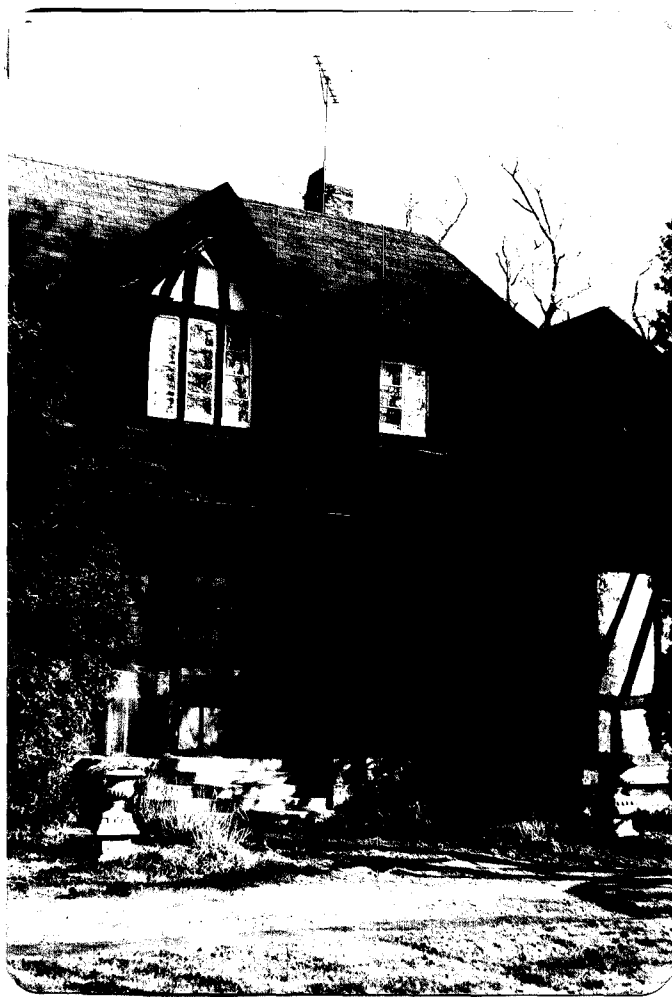
South entrance to laundry, now a residence