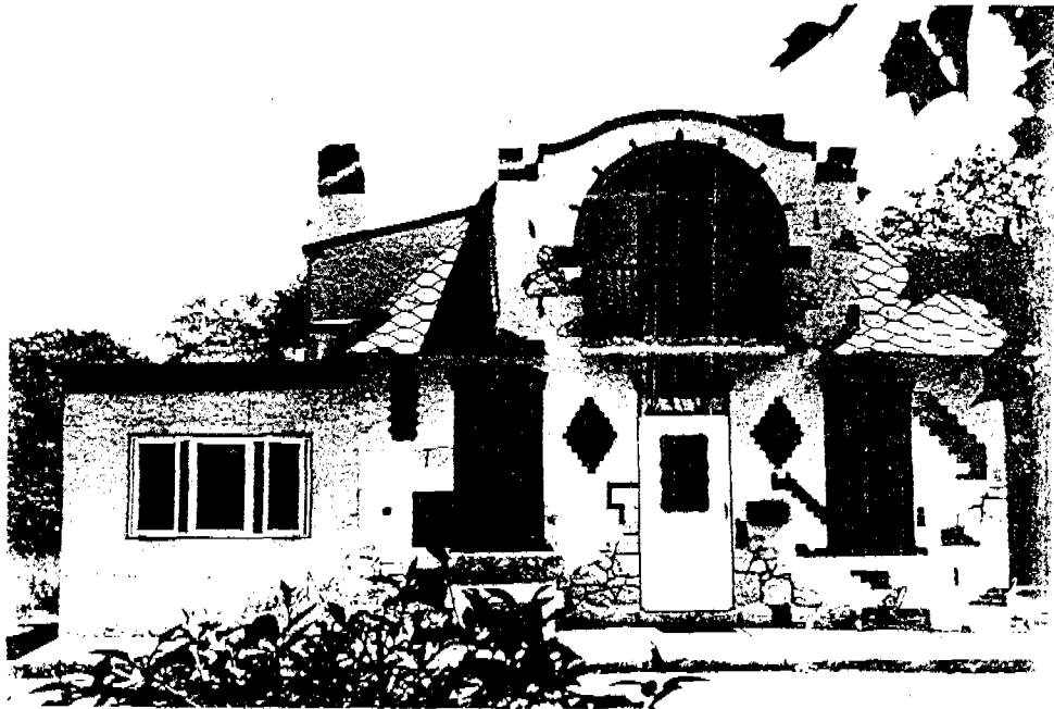
Private Residence, c. 1915.

Pisciotta House, from "Eccentric Landmarks of Suffolk County" exhibition catalog, Islip Art Museum, 1983.