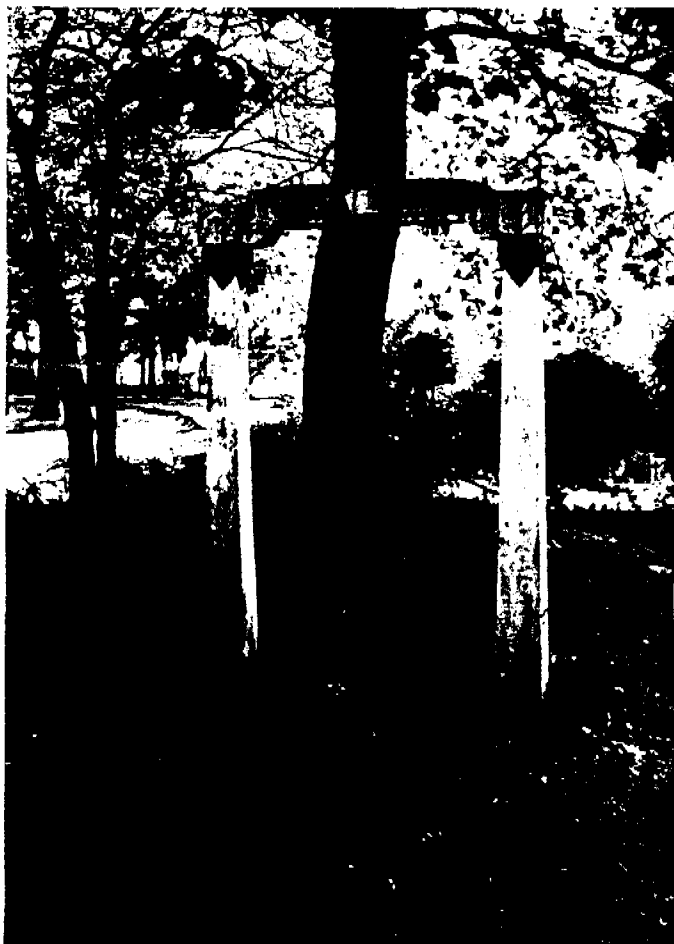
Neg. KK XXVII-19, showing masonry sign post (?) in front yard.