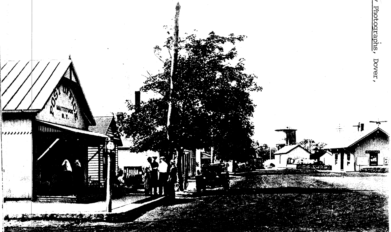
11 The one story post office that was enlarged by Wehrenberg.