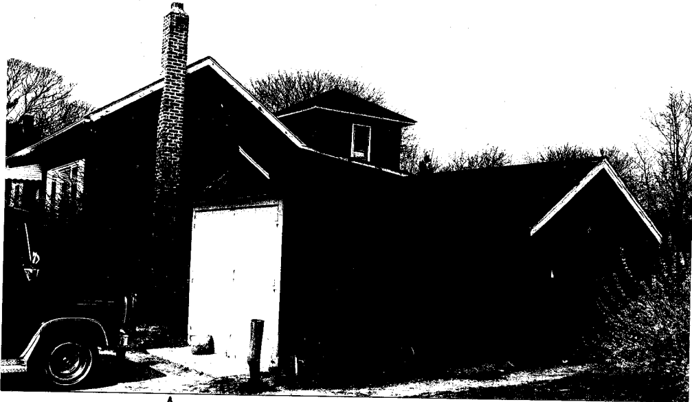
Neg. KK XXII-12, A fm. SE, showing portion of house with tower. According to the owner, the tower is the remains of a water tower that supplied the property.