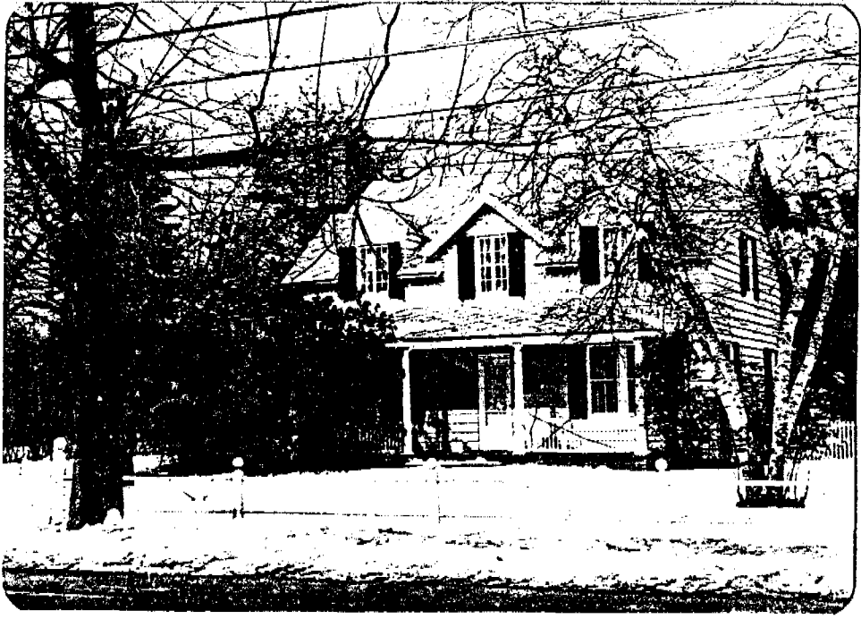
# 105 RIVER ROAD FRONT FACADE