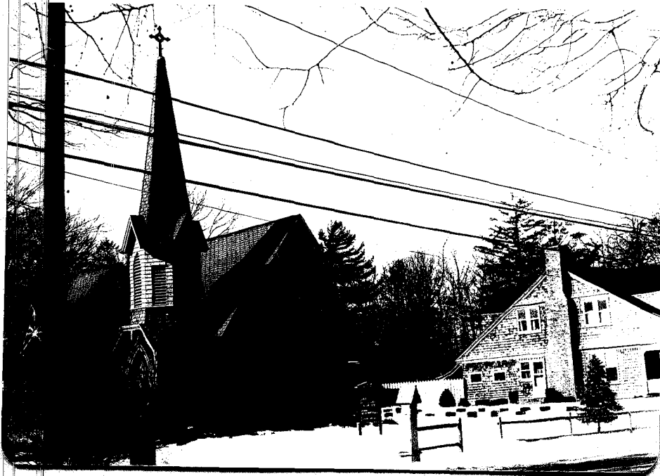
HP-1 looking west