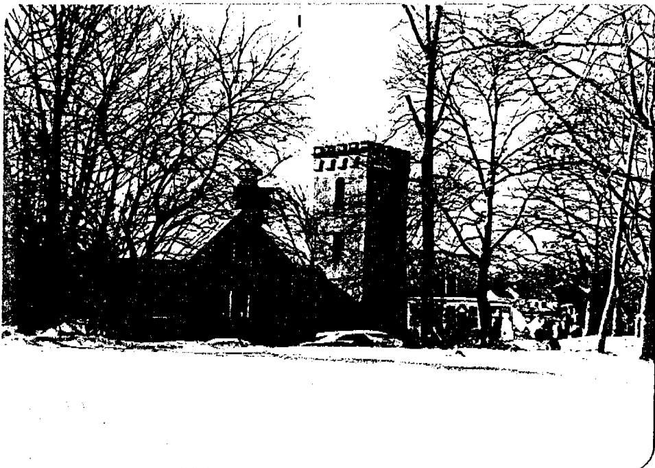
HP-1 looking west