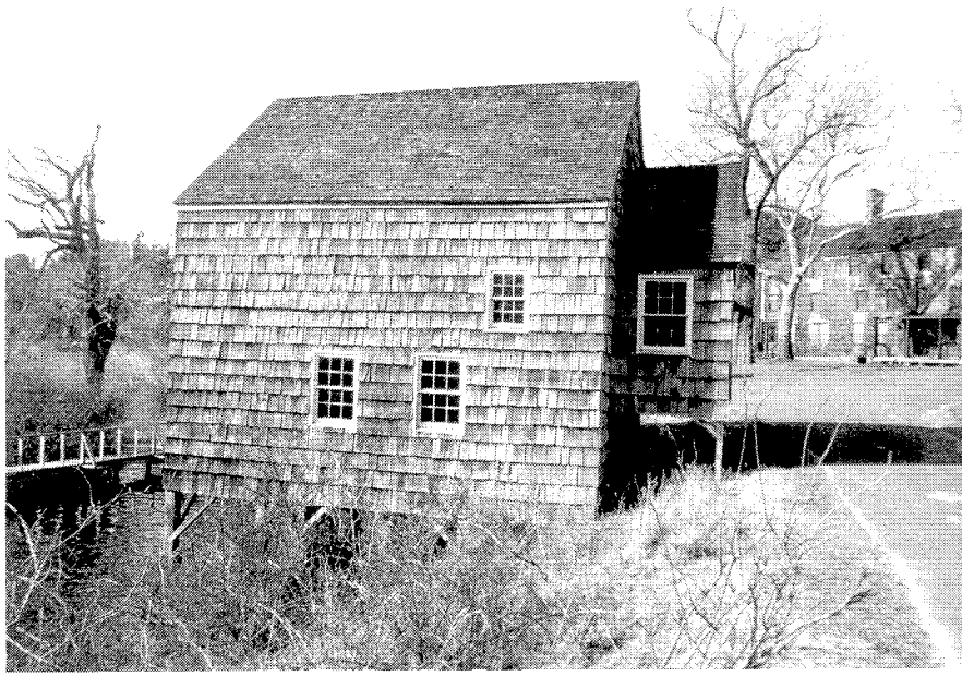
View west 1/20/97