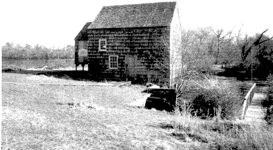
View east 1/20/97