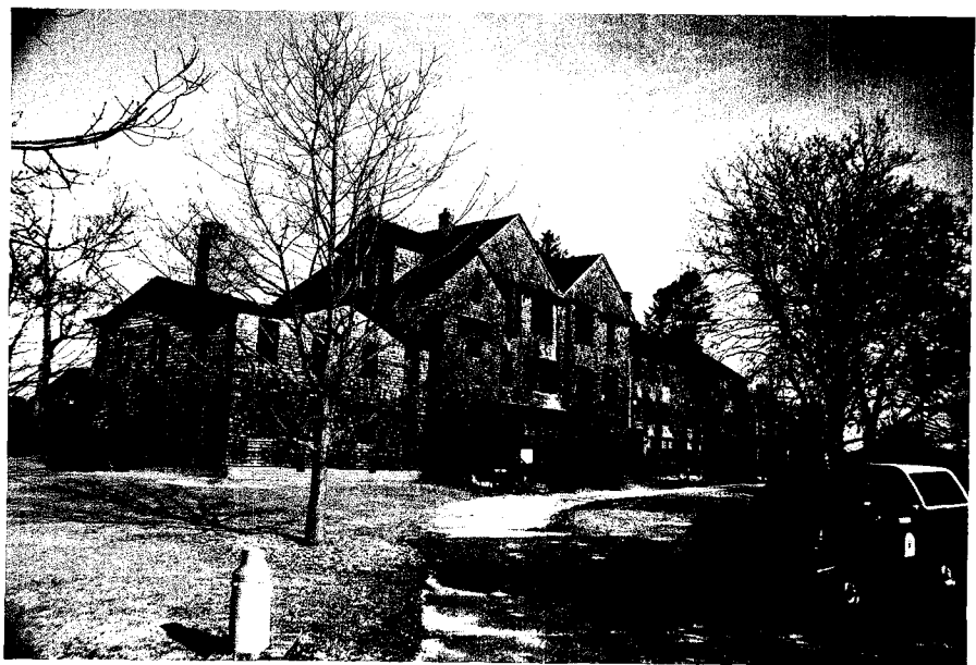
View north-west 1/20/97