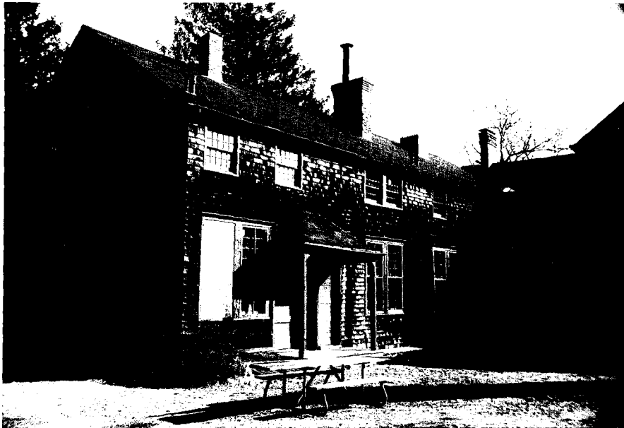
rear wing, view north-east