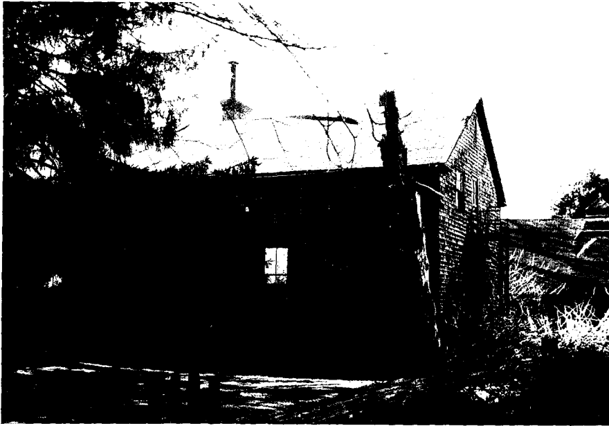
rear wing, view south