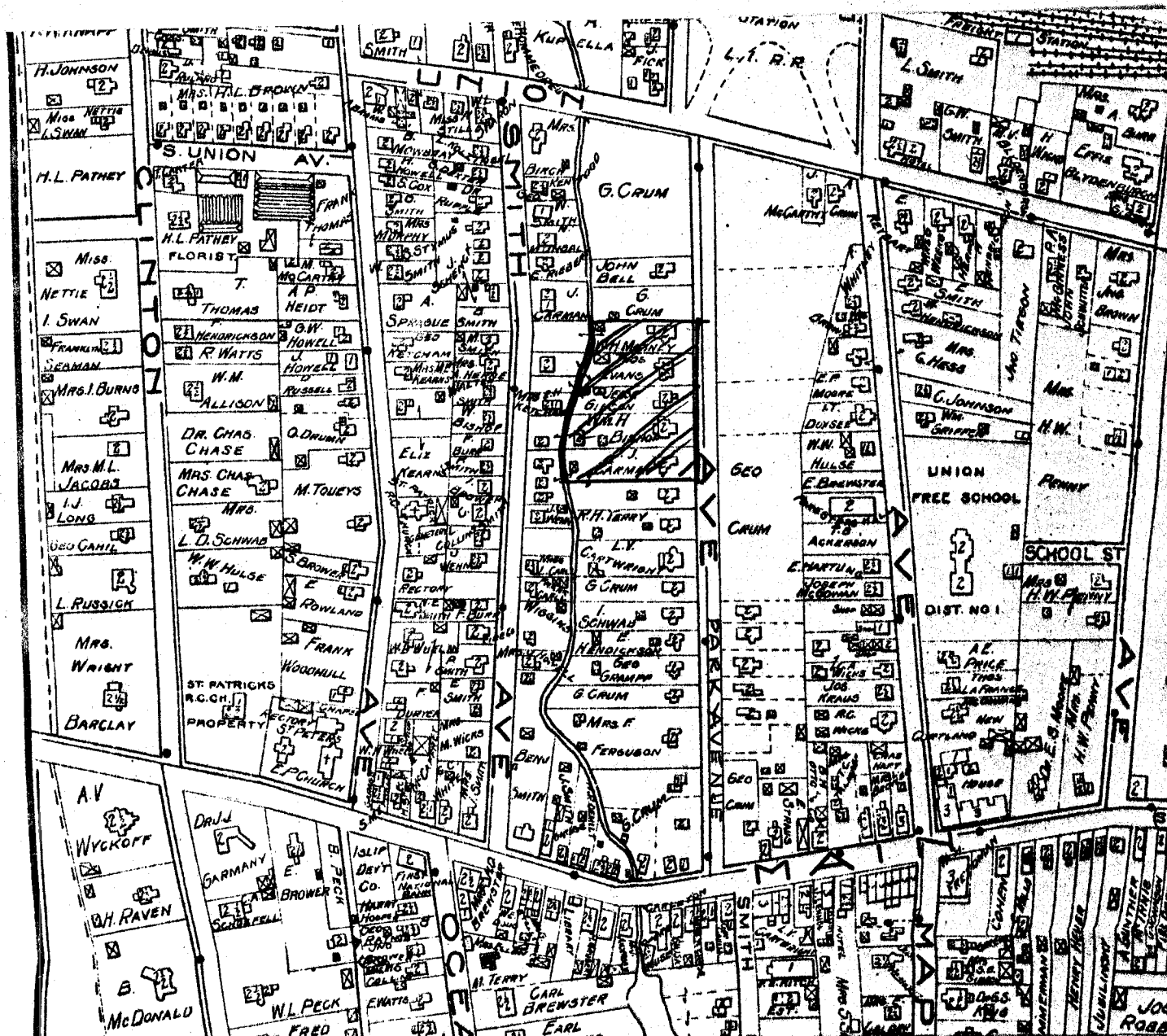
F. BELCHER HYDE · ATLAS OF THE OCEAN SHORE 1915 · PLATE 21